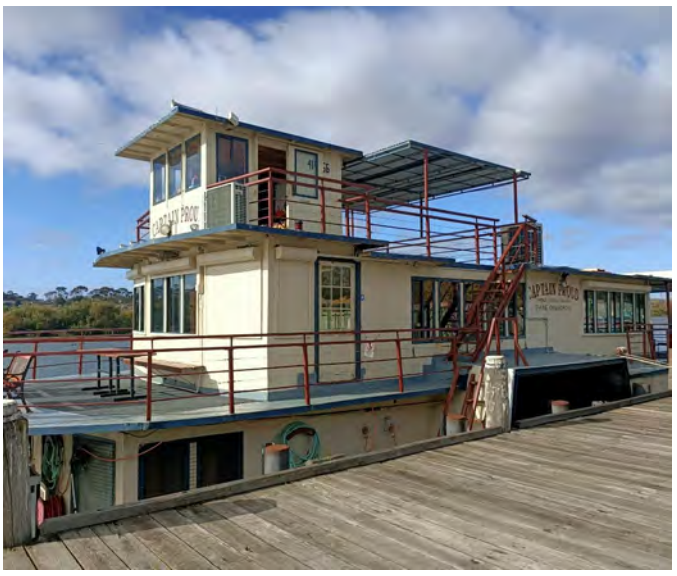
MURRAY BRIDGE - PADDLE STEAMER BUS TRIP