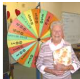
Wheel of Fortune