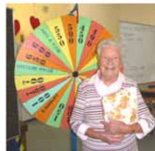
Wheel of Fortune