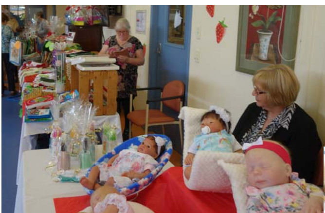
Stalls in the Social Centre

Bargain hunting at the TLH Auxiliary Stall