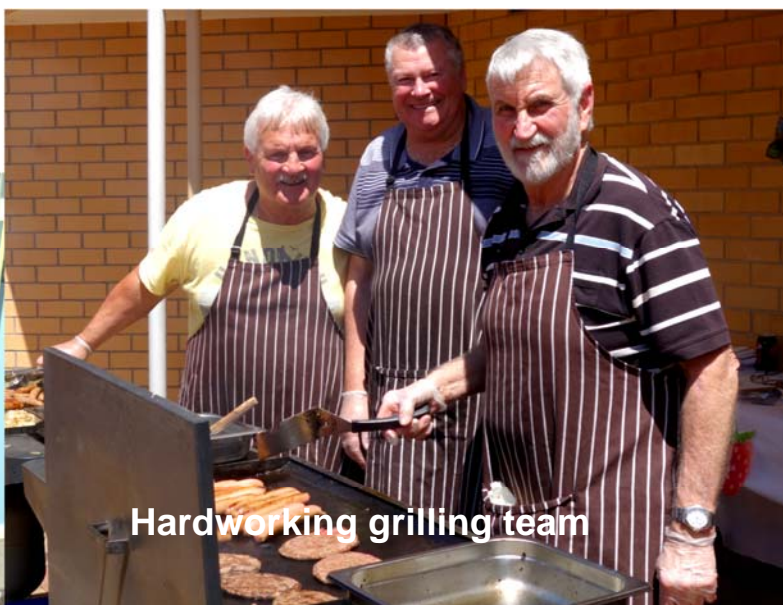
Hardworking grilling team