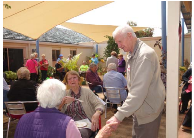
A perfect day in the Courtyard