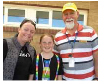
FUN TIME AT THE FAIR