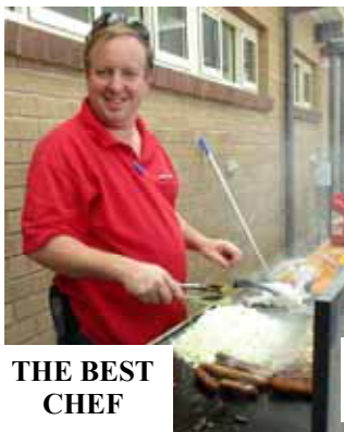
THE BEST CHEF