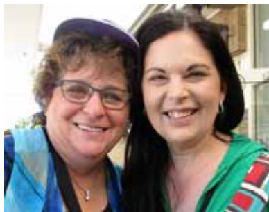
SMILE FOR THE CAMERA