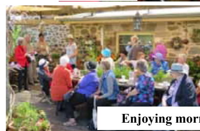
Enjoying morning tea