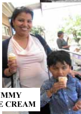
YUMMY ICE CREAM