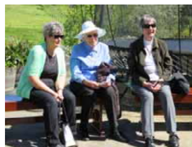
Time for a Rest