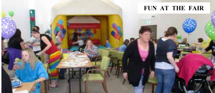
FUN AT THE FAIR