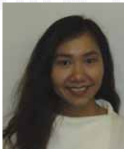
Prathet Dien RN