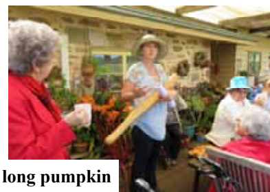
A very long pumpkin