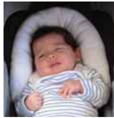
BABY CAME TOO